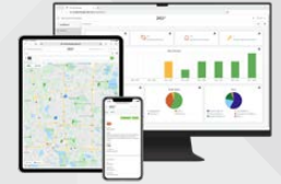
Manage this device with Digi Remote Manager