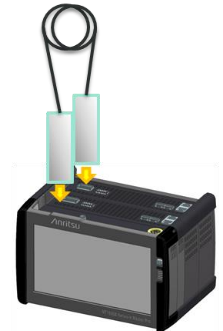
DAC/AOC Back to Back test Made easy by 400G Dual Port in one single chassis