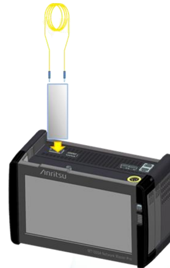
Optical loopback test

Frame loss, Frame loss ratio measurement FEC Corrected Symbol Error distribution analysis FEC Corrected Symbol error rate measurement MDIO/I2C analysis No Frame (PRBS) pattern BER test