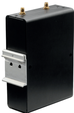
DIN-Rail Mount Illustration