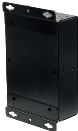
Wall Mount Illustration